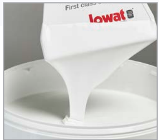
The information given in this leaflet is based on test results from our laboratories as well as on experience gained in the field, and does in no way constitute any guarantee of properties. Due to the wide range of different applications, substrates, and processing methods beyond our control, no liability may be derived from these indications nor from the information provided by our free technical advisory service. Before processing, please request the corresponding data sheet and observe the information in it! Customer trials under everyday conditions, testing for suitability at normal processing conditions, and appropriate fit-for-purpose testing are absolutely necessary. For the specifications as well as further information, please refer to the latest technical data sheets.